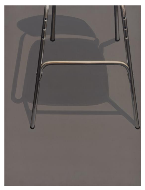
Under-Space , 1966. Acrylic on fiberboard, 31 ½ x 24 in.

Jacquette's work is included in the collections of over forty museums, including the Brooklyn Museum, NY; Hirshhorn Museum and Sculpture Garden, Washington, DC; The Metropolitan Museum of Art, NY; The Museum of Modern Art, NY; New-York Historical Society, NY; Philadelphia Museum of Art, PA; Portland Museum of Art, ME; St. Louis Art Museum, MO; Stanford University Art Museum, CA; and Whitney Museum of American Art, NY.