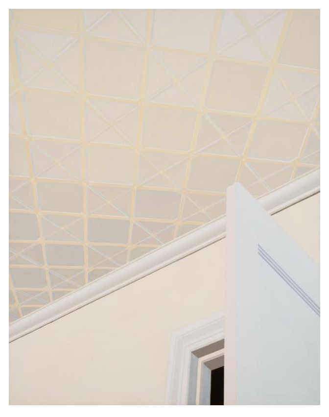
Open Door, Tin Ceiling, 1969. Acrylic on canvas, 75 1/2 x 59 3/4 in.

535 WEST 22ND STREET NEW YORK NEW YORK 10011 212 247.2111 DCMOOREGALLERY.COM