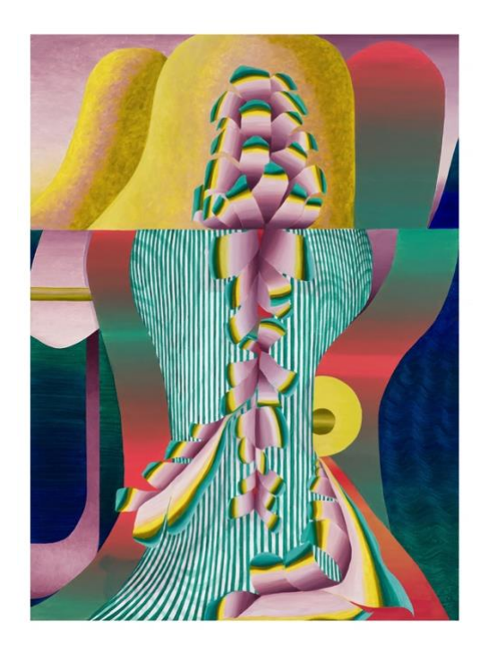
Foxtail, 2022. Oil on linen, 52 x 38 inches.

This exhibition is accompanied by a catalogue featuring the interview, Becoming & Unbecoming , with the artist and Elizaveta Shneyederman.