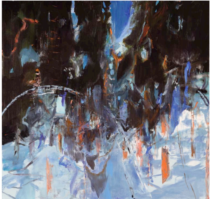
Father's Birthday , 2015. Oil on linen, 48 x 50 in.

DC Moore Gallery is pleased to present Wilderness Studio , an exhibition of new work by Eric Aho that uses the painterly languages of representation and abstraction to explore the lived, remembered, and imagined experience of landscape. A catalogue with an essay by Nathan Kernan accompanies the exhibition.