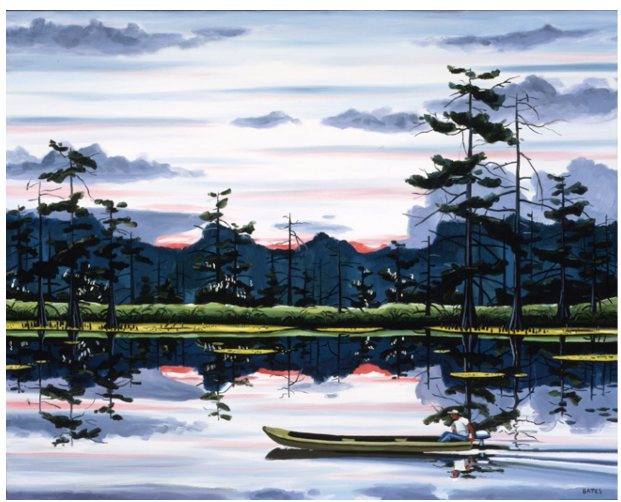
First Light II, 2006, oil on canvas, 48 x 60"

against the onslaught of hurricane force winds and surging water are disappearing. They have been disappearing for decades. Broken Top shows a cypress swamp in fall color. The sky and sod are an eerie but surprisingly beautiful orange. A lone egret looks on, as if in witness. Bait House II depicts a lake at night, it looks peaceful, stars are visible in the sky, all seems well, but still, an unsettling tension pervades.