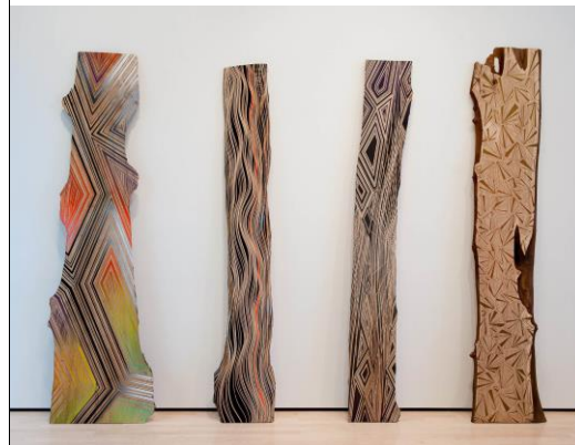
Jason Middlebrook Planks , 2014 Installation view