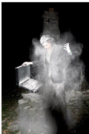
Dana Hoey ASH-Double Check , 2007 Archival inkjet print 64 ¾ x 44 ¾ inches