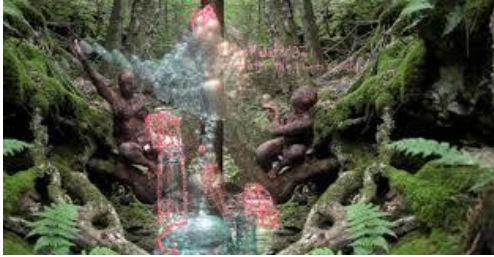
Jacolby Satterwhite Reifying Desire 6 , 2014, HD digital video, 24:04 minutes; color; sound