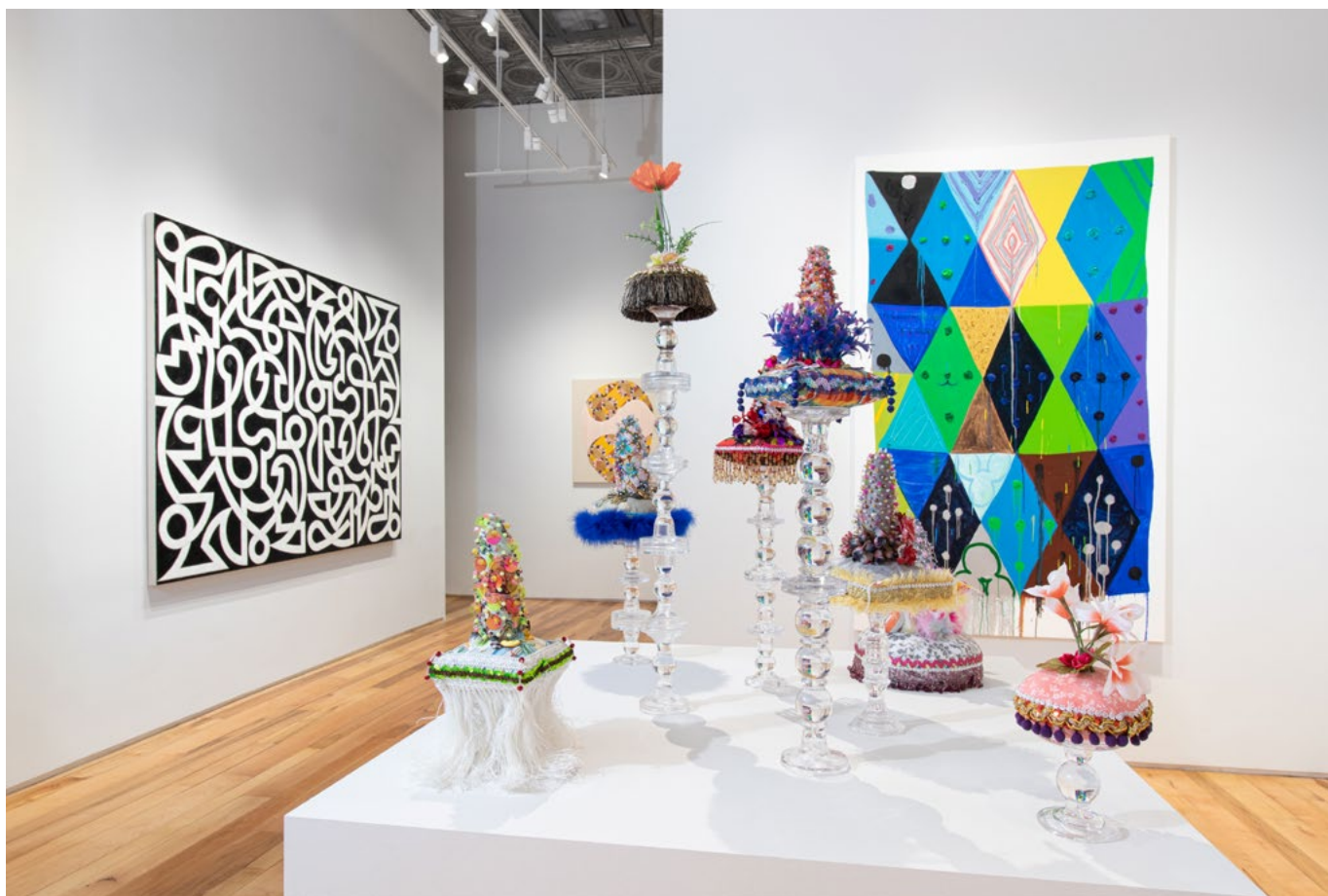
“Fringe” at Denny Dimin Gallery, New York, installation view.