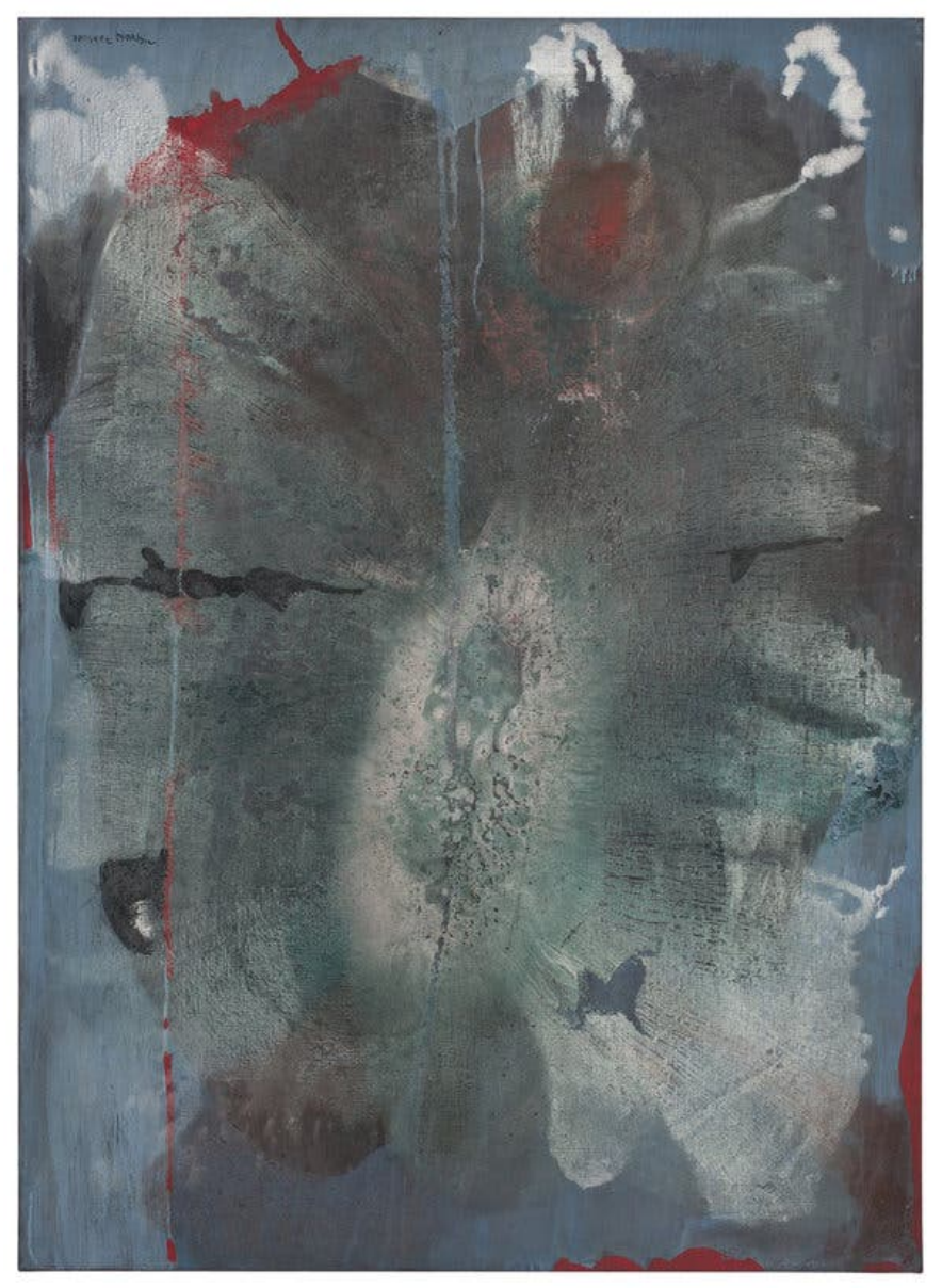
Romare Bearden's "Wine Star," from 1959, on view (and online) at DC Moore Gallery.

Although famous for figurative works, the American modernist had a little-known foray into abstract painting that included some of his best work.