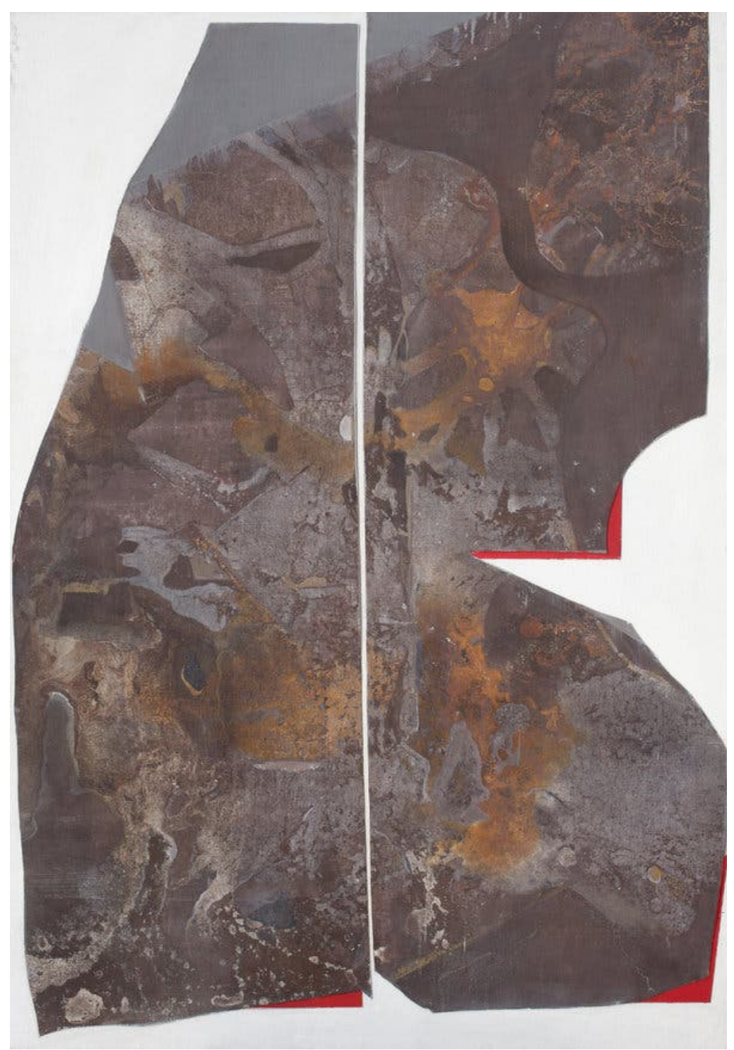
"White Mountain," circa 1962, oil and casein on canvas, cut and mounted on painted board with graphite.

These paintings should startle. They are elegant, gritty works, alive with spontaneous splashes, pours and rivulets of paint, and they effortlessly claim a place in the history of American postwar abstraction, stain painting division.