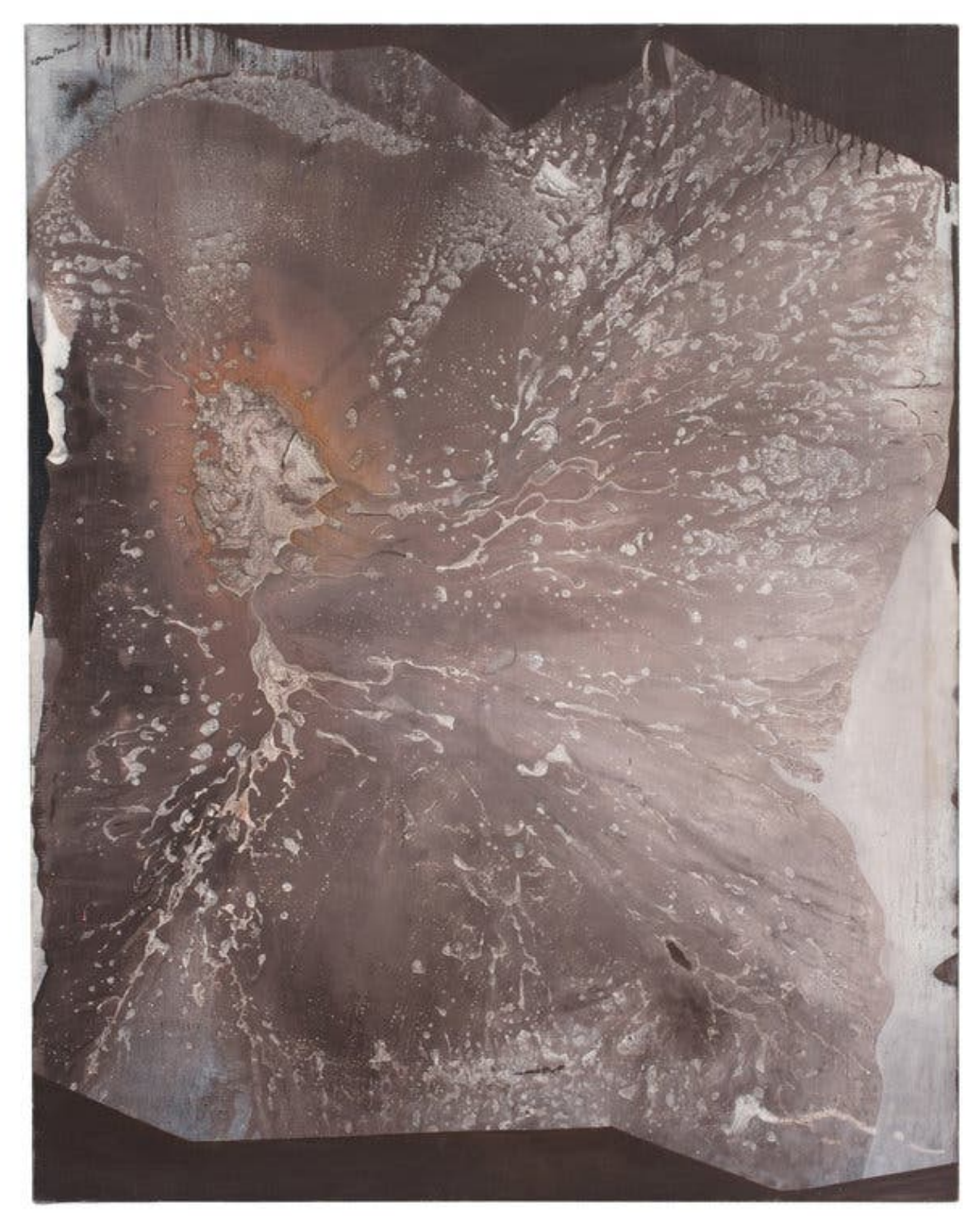
"Mountain of Heaven," circa 1961. Bearden mixes oil paint and casein, which don't mix, but contract into jewel-like globules.