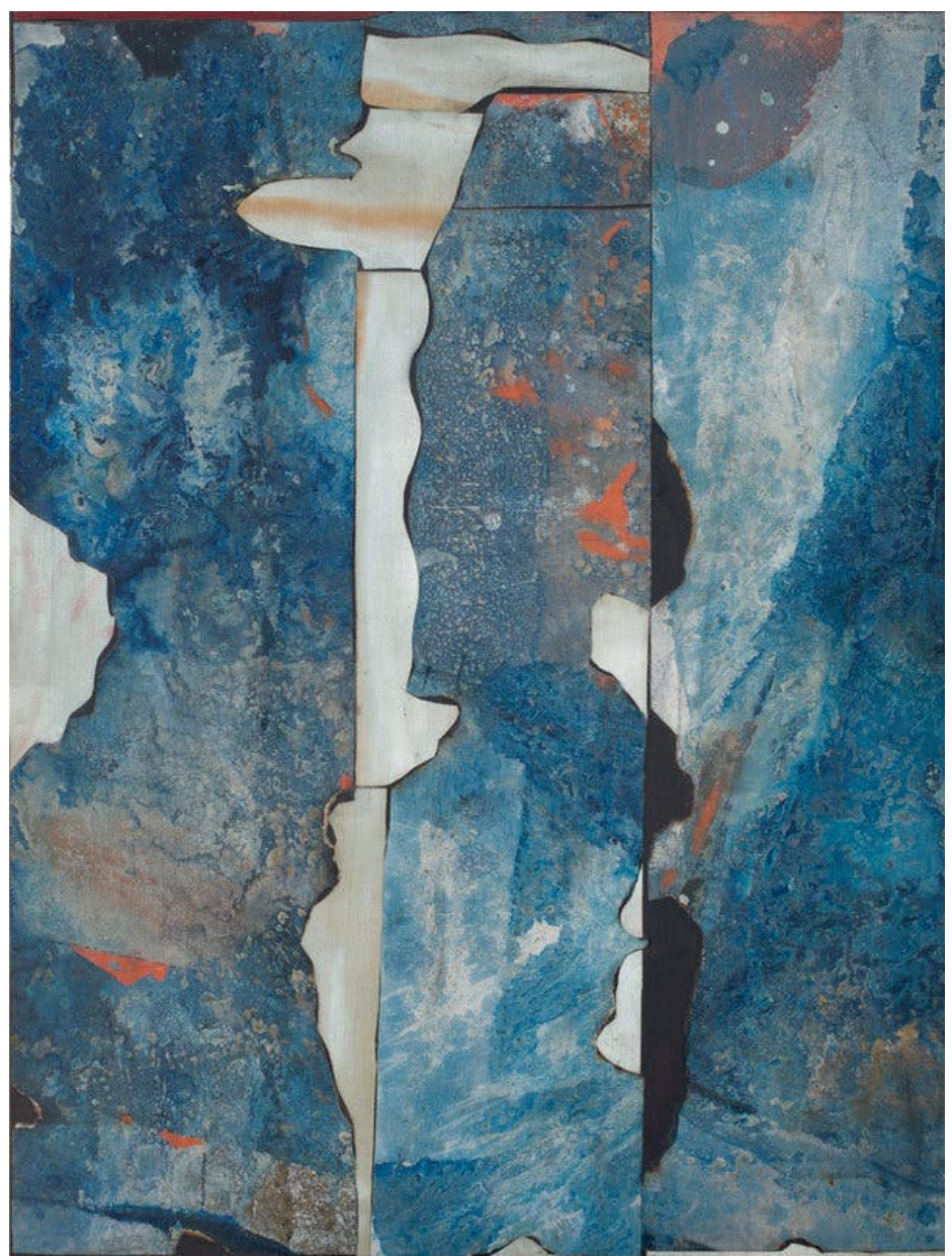
In "River Mist," from 1962, the wavy-edged pieces of canvas painted blue or silver overlap, suggesting wisps of moisture rising from a body of water.

The intuitive experimental confidence with which Bearden varied his techniques and materials is especially visible here. In "Mountain of Heaven" he mixes oil paint and casein, which don't mix, but contract (seemingly rapidly) into little jewel-like globules of white on brown. In "White Mountain," the same admixture congeals into a dry, mineral hardness.