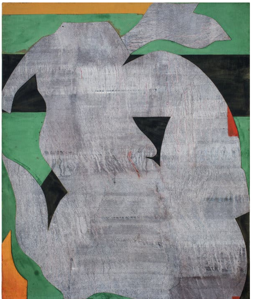
"Untitled (Green)," undated, oil, casein and colored pencil on canvas that has been cut and mounted on painted board, complicating the artist's process.Credit...Romare Bearden Foundation;, via DC Moore Gallery

In the evocatively titled "River Mist," wavy-edged pieces of canvas painted blue or silver overlap, suggesting wisps of moisture rising from a body of water — although we are challenged to decide which pieces are river and which are mist. At the same time, the ease with which Bearden's scissors cut these ripples makes the material surface itself mesmerizing. Elsewhere Bearden complicates his combination of collage and painting. In the undated "Untitled (Green)," he paints on the background board in mostly green and black and then shapes and cuts holes in a large piece of silver-painted canvas so that the colors peek through or around it at different points. The totality evokes a heraldic banner, but also a fortress facade.