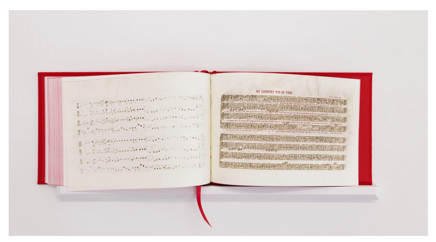
"America: A Hymnal" by Bethany Collins features a book printed with the lyrics of 100 different versions of "My Country, 'Tis of Thee." Bethany Collins; Photo: Tim Johnson, via PEM

Another gallery adjacent to "Struggle" is a chapel-like space featuring Bethany Collins's "America: A Hymnal" (2017), a book printed with the lyrics of 100 different versions of "My Country, 'Tis of Thee" written between the 18th and 20th centuries, variously supporting revolution, abolition, temperance, suffrage, the confederacy and slavery.