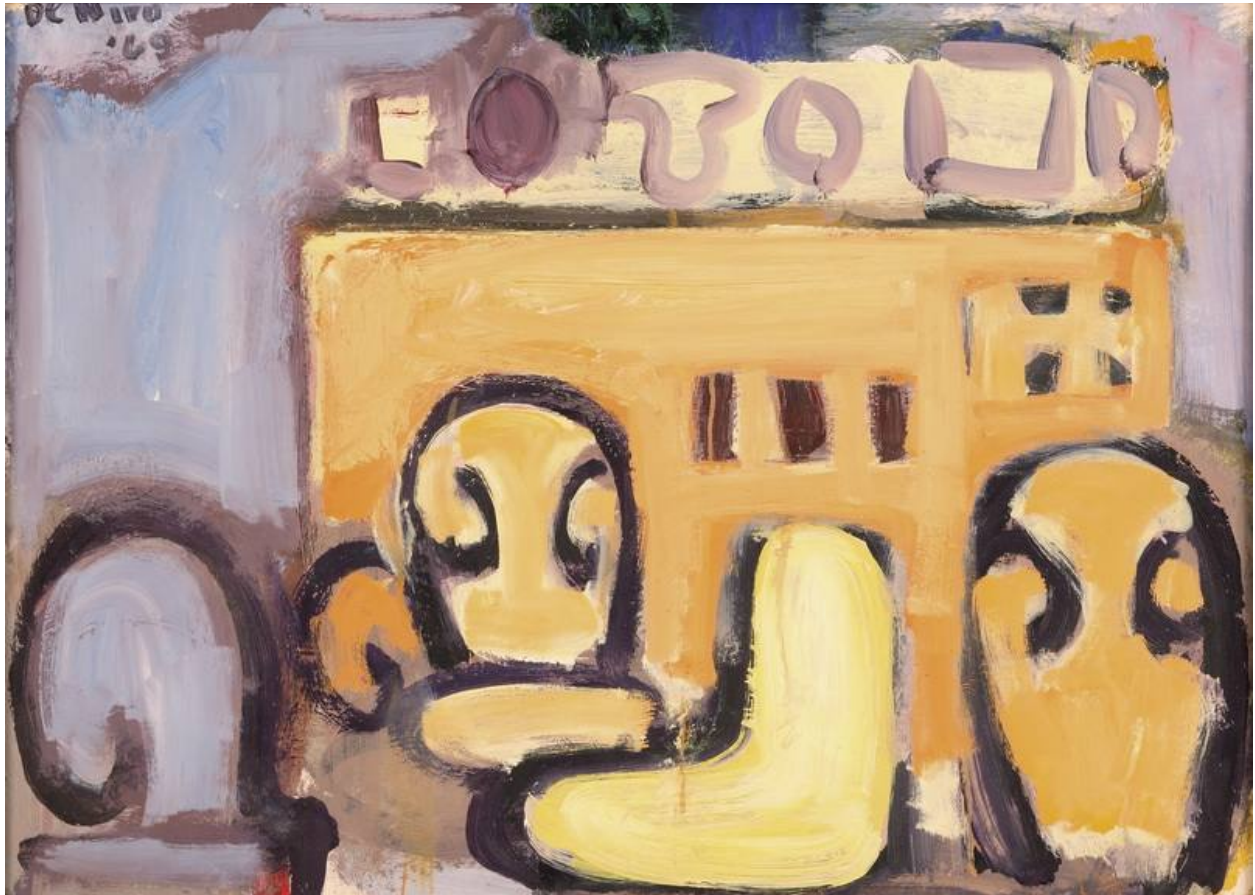
Robert De Niro - Interior with Still Life and Chairs, 1969. Oil on masonite, 21 3/4 x 30 inches