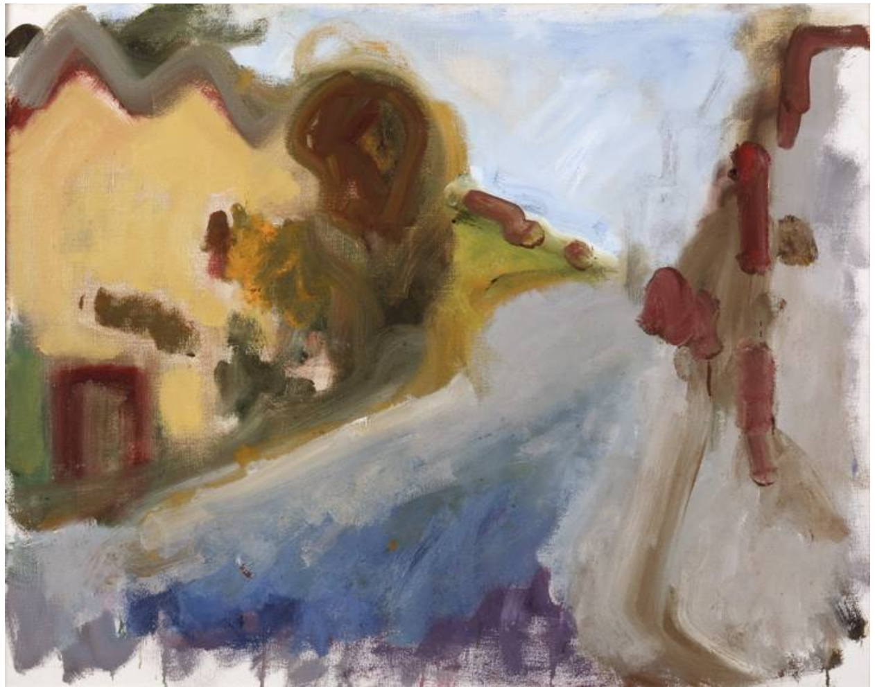
Robert De Niro - Landscape with Road, n.d. Oil on canvas, 27 1/4 x 34 1/4 inches