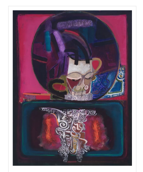
Current Forms: Yoruba Circle, 1969. Acrylic on canvas, 44 1/4 x 34 inches.

While works with overt protest are rare in Driskell's oeuvre, he found compelling reasons to initiate several works of sociopolitical commentary during the late 1960s and early 1970s. Important compositions in this vein include Ghetto Wall #2 (1970). Driskell imagines a painting-within-a-painting: a mural that covers an inner-city brick wall, a distinctly American phenomenon that arose with the Civil Rights movement, as a community effort to counter blight in stressed neighborhoods. The form of the X appears, a mark symbolic in this work of Civil Rights leader Malcolm X, as Driskell himself has noted. He also alludes to the American flag, its stripes appearing in two places on the canvas, and which also prefigure the African ribbon forms he would soon incorporate into other works.