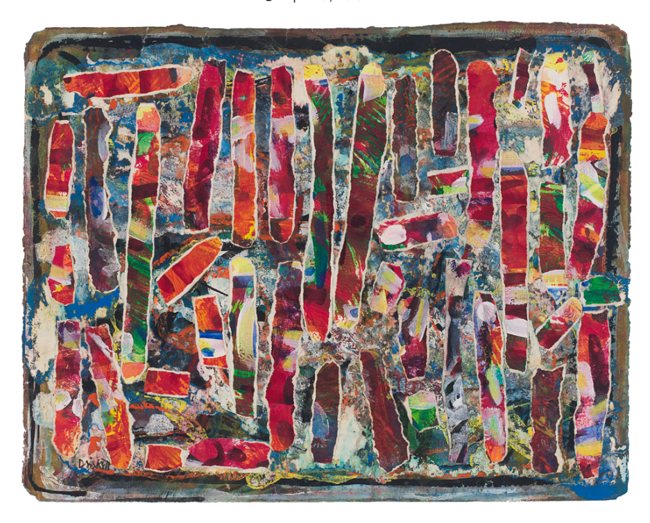
April 11 – June 8, 2019