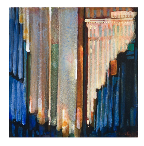
Mark Innerst Locust, 2011, acrylic on paper, 6 x 6 inches.

Isabel Bishop's exquisite pencil drawing takes place on a blue paper background; wearing a simple chemise, a young woman sits dozing upright on a bed. Short-haired, with crossed arms, her hands landing in her lap, the figure emanates a gravitas that brought about by her closed, deep-set eyes. Despite the supposed ephemeral nature of the medium Bishop has chosen, the image conveys considerable weight. We have no idea whether the woman's circumstances are tragic, or even marginally troubled, but we appreciate the seriousness of the image.