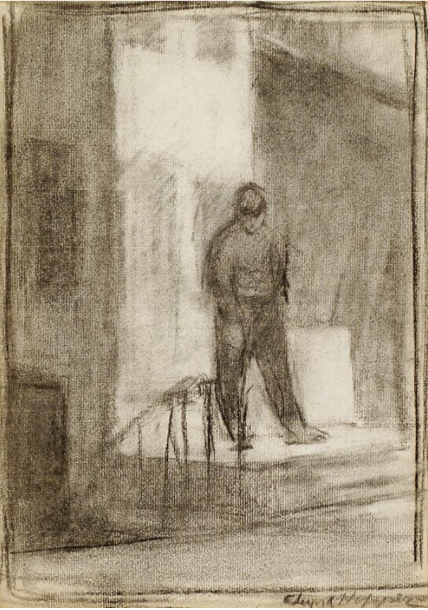
Edward Hopper, Study for Pennsylvania Coal Town, 1947 Charcoal on paper, 11 <sup>3</sup>/<sub>4</sub> x 8 <sup>1</sup>/<sub>2</sub> inches.

On the figurative side, Whitfield Lovell offers two examples of his "Card Drawings" series-one, done in 2000, of a black man with a mustache, in a hat and wearing a tie and suit jacket. Underneath him are three dice-a reference to the limitations of chance. The other drawing, of a black woman (no date) presenting soft features and smiling eyes and mouth, communicates her humanity in conventional but also warmly expressive terms. Four playing cards lie below her visage-another reference to happenstance and fate. Lovell's technical ability here is unquestioned; he shows authority and a good command of the medium of drawing. The references to fate-the dice and the cards-add gravitas to the straightforwardness of the renderings. Another pencil drawing, Portrait (1932-33), by Paul Cadmus is a forthright view of a handsome young man, with touseled hair, a downward gaze, and sharply cut features. Like Lovell's drawings, the strength of this piece is based on excellent observation and a very clean line. While the work is hardly new, either technically or thematically, it maintains a considerable level of skill and succeeds fully in a genre established for centuries. Given that our penchant for improvisation is so considerable, it becomes easy to regard traditional technique as studied, Lovell and Cadmus's drawings remind us just how effective supposedly conventional rendering can be.