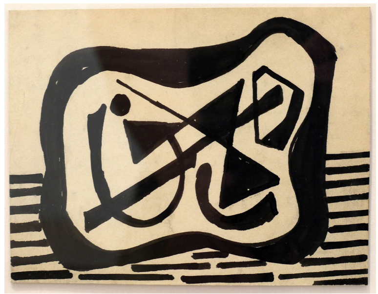
Vaclav Vytlacil, Untitled #1480, c. 1937, ink drawing signed on verso, 5 3/8 x 7 inches.

For this writer, by far the most immediately arresting image (without a title) was done by Romare Bearden, something that looks very much like an abstraction. Painted during the years 1948 to 1952 for his "Iliad Series," this seeming abstraction also suggests a phalanx of spears– the means of defense the Greeks use in the great epic poem. At once an inspired abstract work, filled with thin, black lines that could easily be read as Bearden's version of abstract expressionism, as well as a description of the objects of Greek defense, this painterly drawing,