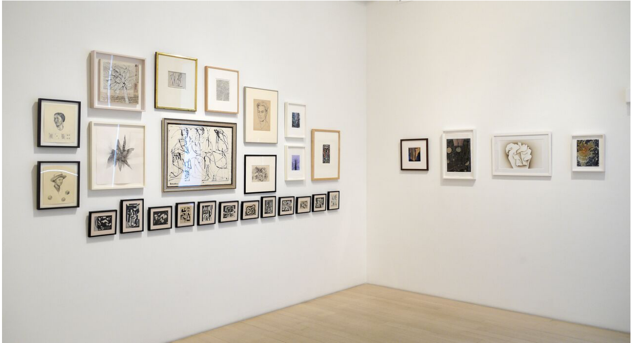
"Line Up" at DC Moore Gallery, installation view courtesy of the gallery.