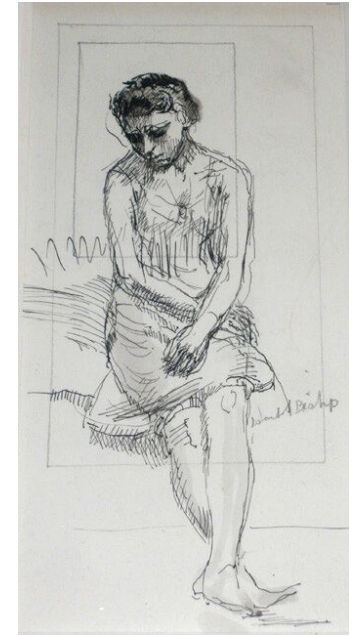
Isabel Bishop, Woman Dozing FF193, c. 1945, ink on paper, 6 x 3 inches.

specifying the location, we would not know where the person is stationed. The mood and imagery are unspecific; it is very difficult to read the face's expression. But that does not stop the study from achieving what Hopper does best: an atmosphere in which much beyond the subject is implied, usually of a grave nature.