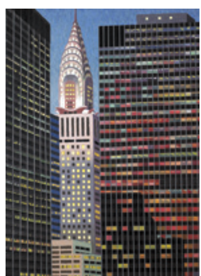
CLOCKWISE FROM TOP: Napa Valley Composite II, 2005. Above Times Square III, 2007. Chrysler Building Flanked by High-Rise Buildings III, 2009.