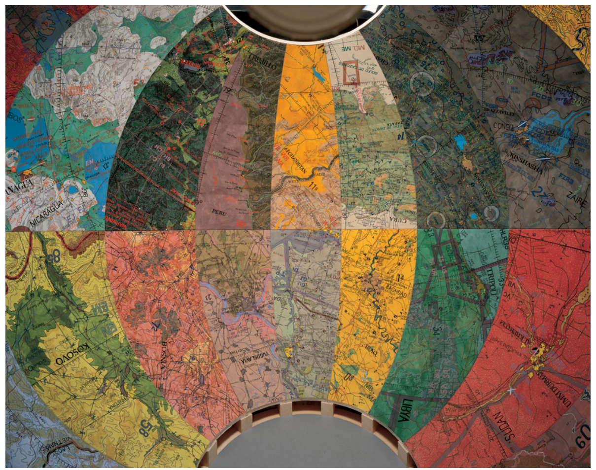
Interior View of Targets

535 WEST 22ND STREET NEW YORK NEW YORK 10011 212 247.2111 DCMOOREGALLERY.COM