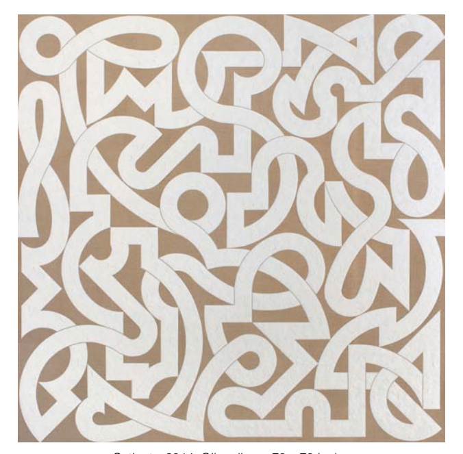
Ostinato, 2014. Oil on linen, 78 x 78 inches,

535 WEST 22ND STREET NEW YORK NEW YORK 10011 212 247.2111 DCMOOREGALLERY.COM