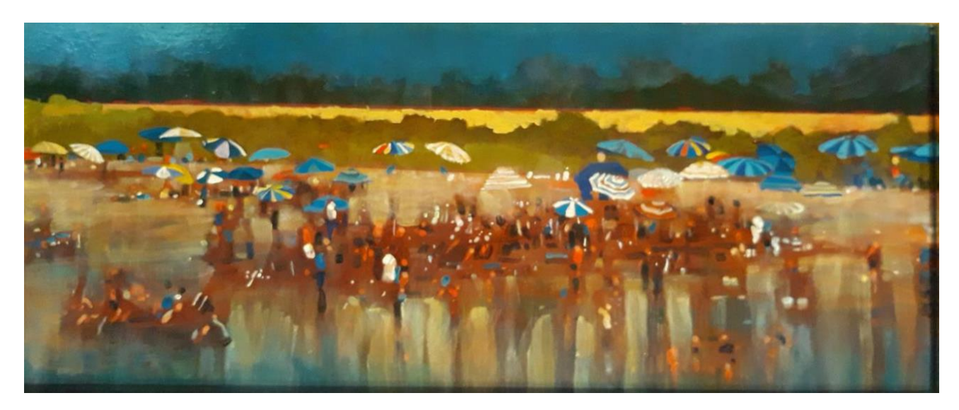
Work in Progress, 2020. Acrylic on board, 10 x 24 inches.

With a sense of liberation, I turned my focus on my interest in figures as part of an urban setting, to a natural one, the beach. I imagined the summer months with masses of people adrift in a profusion of umbrellas, all patterns and colors. I painted rather quickly to capture these effects.