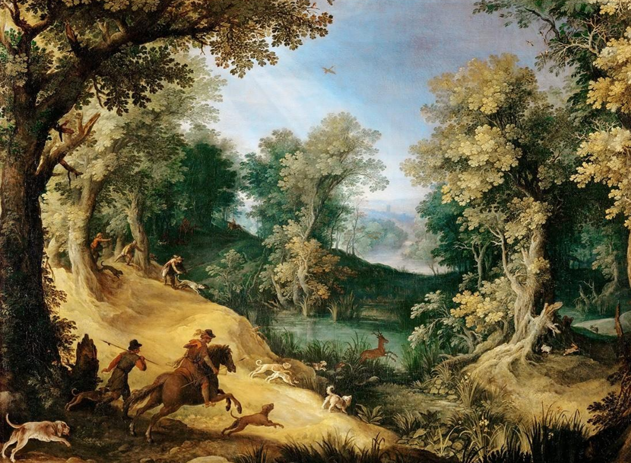
Top: Work in Progress, 2020. \ Acrylic on paper, 9 \ x \ 12 inches. \ Bottom: Paul Bril, \textit{Stag Hunt}, 1595. \ Oil on canvas, 41 \ x \ 53 inches.