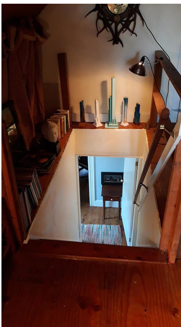
Mark Innerst studio

I painted the flat hollow core doors to the studio to appear paneled. With the stairs just steps from my bedroom, it's so private. The steps going up are steep. A selection of books and objects rest at the top.