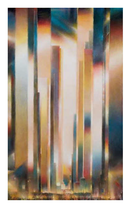
Beacon , 2019. Oil on canvas, 60 x 36 inches.

With a sense of liberation, I turned my focus on my interest in figures as part of an urban setting, to a natural one, the beach. I imagined the summer months with masses of people adrift in a profusion of umbrellas, all patterns and colors. I painted rather quickly to capture these effects.