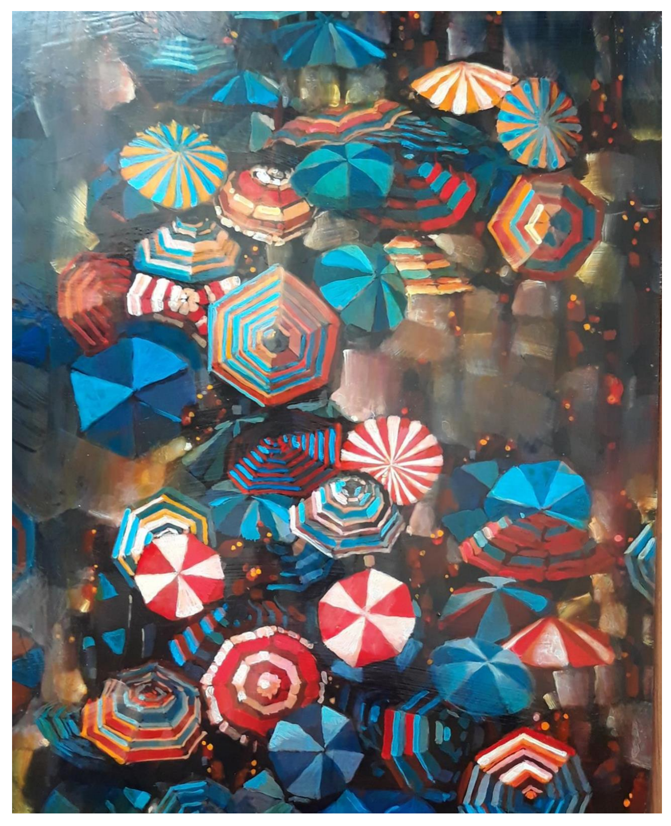
Work in Progress, 2020. Acrylic on board, 20 x 16 inches.

I began to compose the umbrellas more carefully in smaller groups, and with the use of chiaroscuro light they quieted down and felt introspective. I approached them like a portrait, or a small group portrait, with just a hint of a background and place.