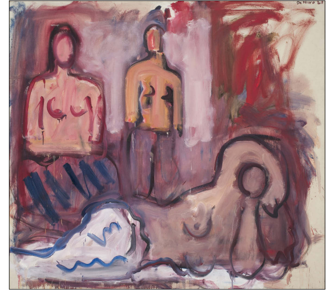
De Niro Sr.'s Three Women, 1968, oil on canvas.