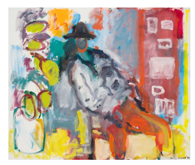
Robert De Niro, Sr., "Figure in a Hat with Rubber Plant" (1976), oil on canvas, 50 x 60

De Niro painted like the French symbolists he admired: a repetition of forms and motifs symbolizing ideals: beauty, sensuality, music, poetry. He was reductive rather than graphic: expressing a feeling rather than a narrative. It is clear from both the quality of his line and his writings on art that he valued understatement. He suggests distinct gestures, figural poses, and objects with an economy of means, accuracy, and reserve.