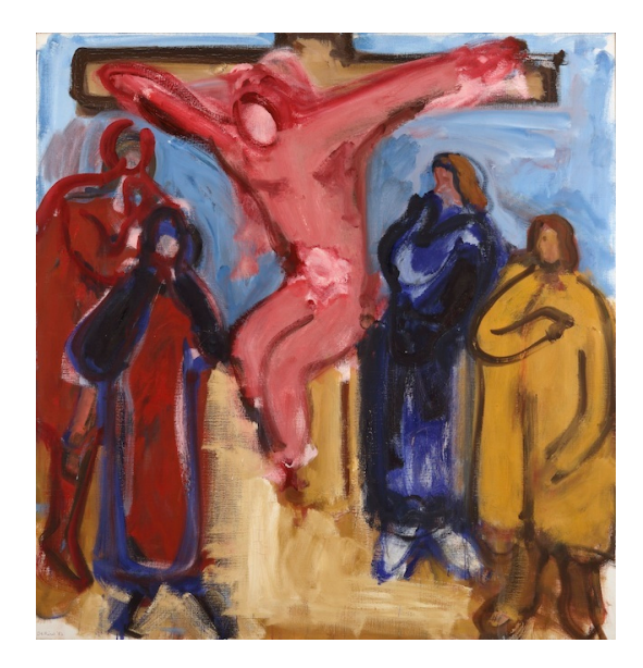
Robert De Niro, Sr., "Crucifixion with Four Spectators" (1982), oil on canvas, 50 1/4 x 48 1/4 inches

And what of De Niro's choices of subject: still lifes, figures, "Moroccan Women" à la Delacroix, Greta Garbo as Anna Christie, and the crucifixion? Indeed, De Niro made many crucifixions. This series was the subject of Eleanor Munro's 1959 Art News profile, "De Niro works on a series of pictures," reprinted in the DC Moore exhibition catalogue. However, no crucifixion paintings are present in the exhibition, and neither are they discussed in the documentary. It is a poignant omission, considering the documentary's positioning of De Niro as an artist suffering from partial exile in the art world, steadfastly adhering to his aesthetic beliefs. (De Niro, born into a Catholic family, explored spiritual paths from Edgar Cayce to Krishnamurti to Christian Science.