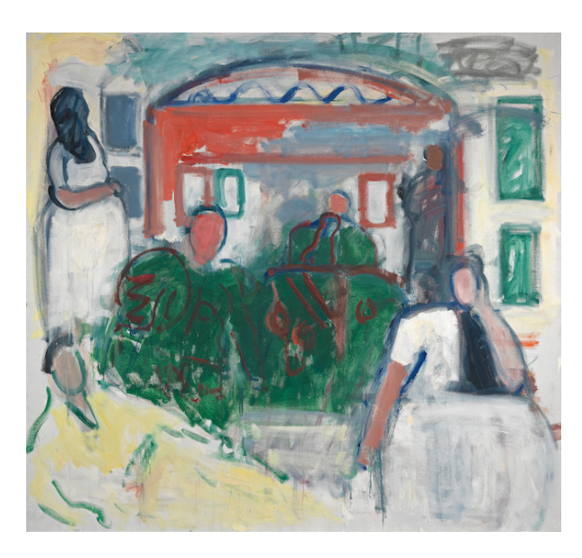
Robert De Niro, Sr., "Moroccan Women" (1984), oil on linen, 70 x 76 inches, private collection

The defining characteristic of De Niro's work is the line: the arabesque that rounds the form of the female figure, the guitar, the vase, and the brusque angles that define table edges, houses, windows. He uses these marks even to cover deeply saturated color areas. These gestural outlines have the energy of Abstract Expressionism, yet, if Willem de Kooning deconstructed forms, De Niro put them back together. Perhaps this is why Storr speaks of "pleasure," why the painter Paul Resika, interviewed for the film, admires his precociousness.